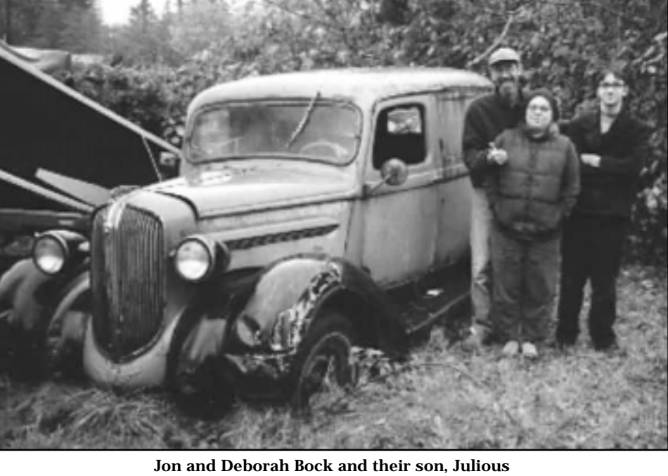
with there missing 1938 Plymouth Panel

original police report on the missing car.