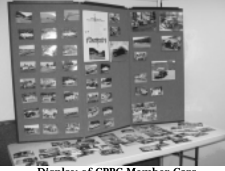
Display of CPPC Member Cars